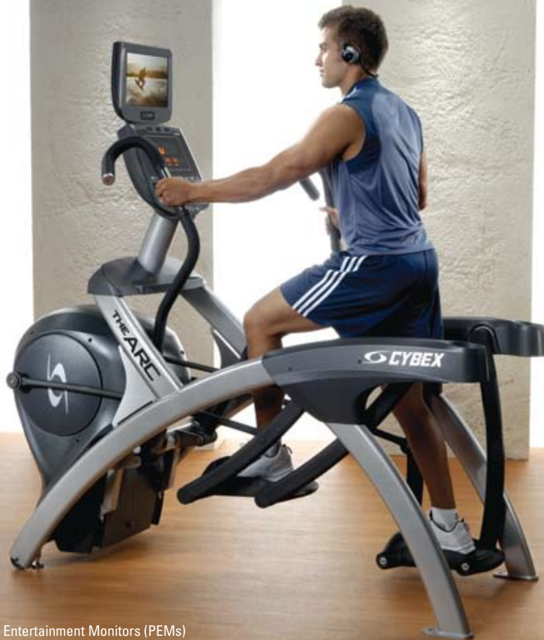
*Shown with optional Personal Entertainment Monitors (PEMs)